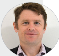
Dr Sam Harris